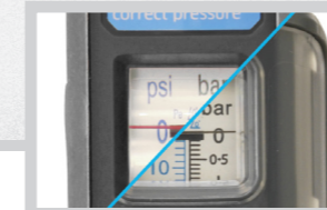
Large viewing window