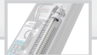
Improved Piston Design